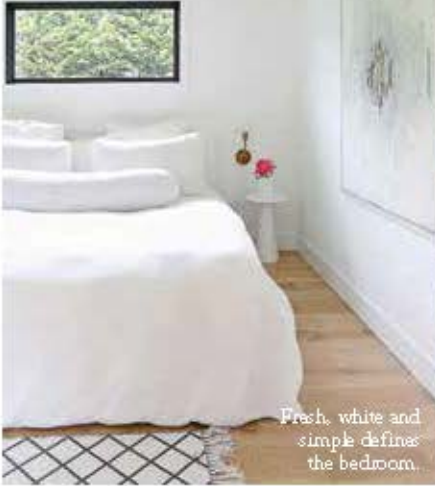
Fresh, white and simple defines the bedroom.