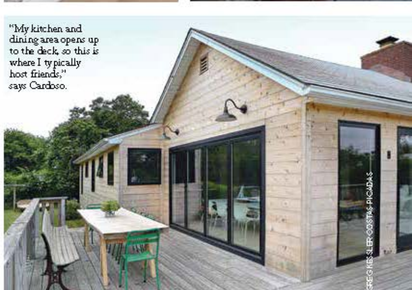
"My kitchen and dining area opens up to the deck, so this is where I typically host friends," says Cardoso.