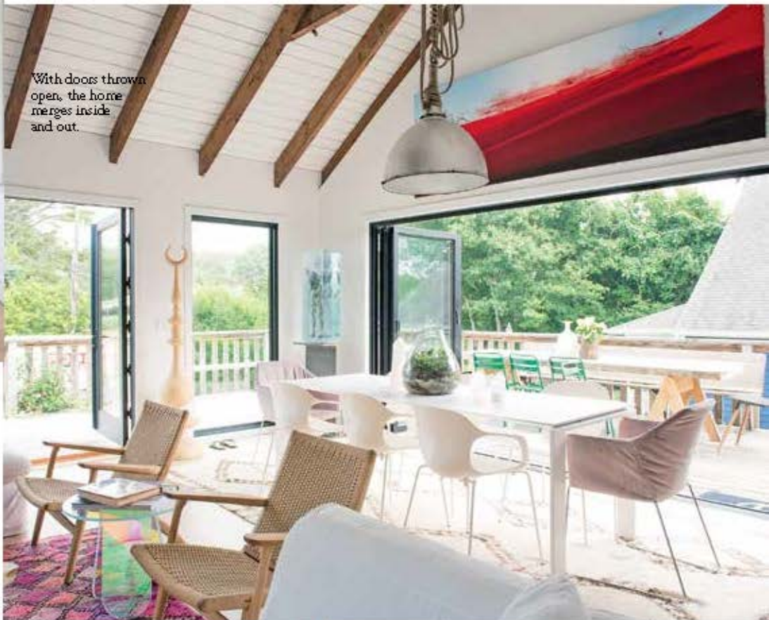
With doors thrown open, the home merges inside and out.