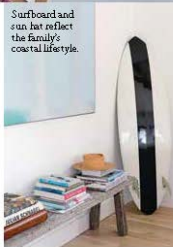
Surfboard and sun hat reflect the family's coastal lifestyle.