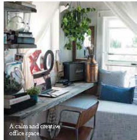
A calm and creative office space.