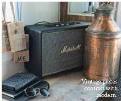
Vintage pieces contrast with modern.