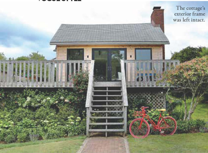
The cottage's exterior frame was left intact.