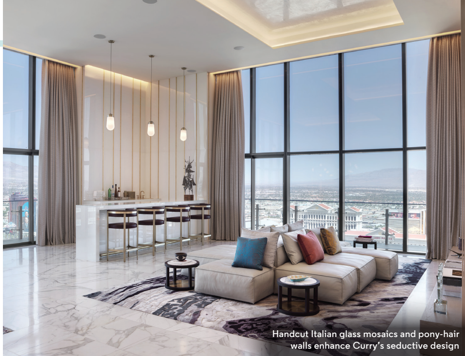
Handcut Italian glass mosaics and pony-hair walls enhance Curry's seductive design