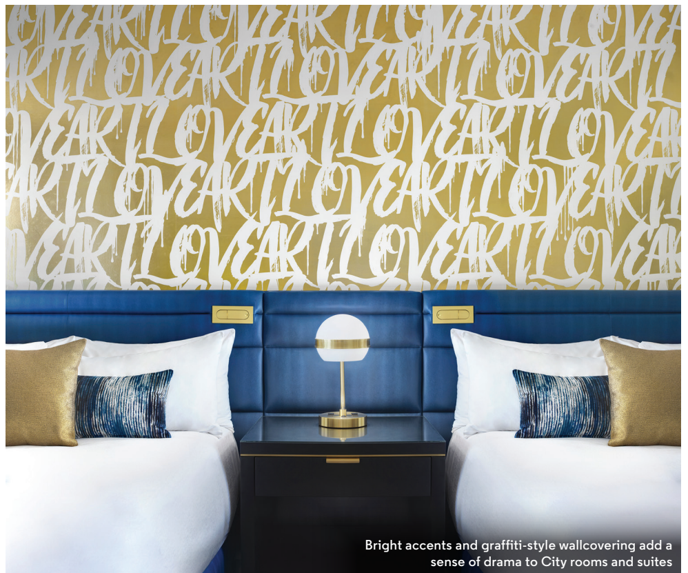
Bright accents and graffiti-style wallcovering add a sense of drama to City rooms and suites