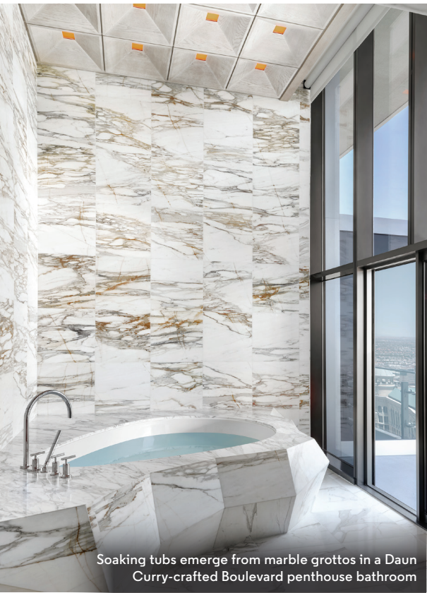
Soaking tubs emerge from marble grottos in a Daun Curry-crafted Boulevard penthouse bathroom